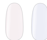
New! Mega White New! Icy White