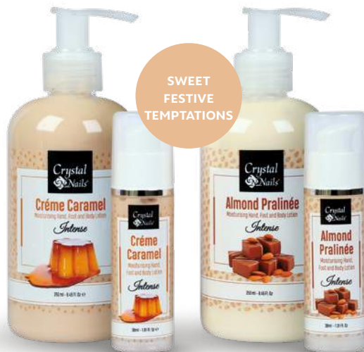
Crème Caramel INTENSE