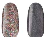
New! R198 New Years Eve New! R199 Blueberry