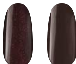
New! R200 Sparkling Burgundy New! R201 Noir Rouge From the middle of November