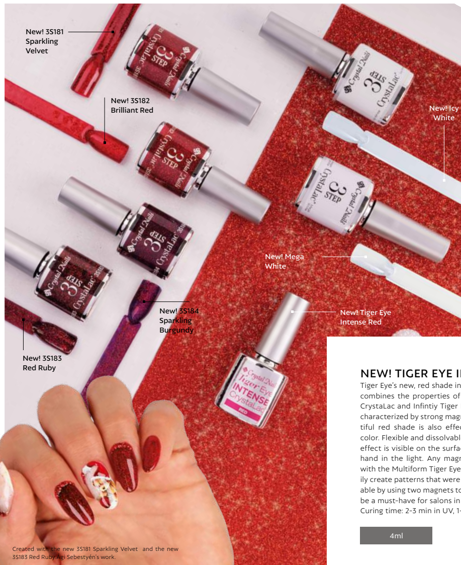
Created with the new 35181 Sparkling Velvet and the new 35183 Red Ruby by Agi Sebestyén's work.