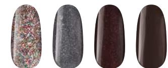
New! R198 New Years Eve New! R199 Blueberry New! R200 Sparkling Burgundy New! R201 Noir Rouge From the middle of November