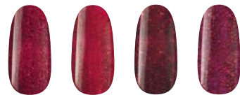
New! 35181 Sparkling Velvet New! 35182 Brilliant Red New! 35183 Red Ruby New! 35184 Sparkling Burgundy