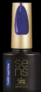
New! Royal blue